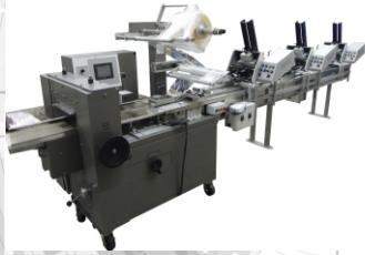
3-Station into Wrapper

Maximize your throughput with an XM One-Shot Collator. This powerhouse is the most robust, advanced system in the world built for high-volume 24/7 production environments. Produce standard or variable collated sets. Configure two to 50 stations with line speeds of 10 to 200 stacks/min. with options to allow for products from 3" to 30" wide!