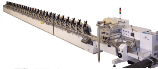
32-Station into Wrapper