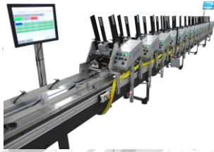
18-Station Collator with SmartControl PLC