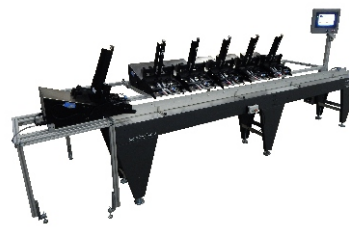
6-Station RX Collator with SmartControl PLC