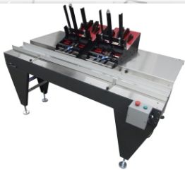
2-Station RX Collator

RX One-Shot Collators are the most affordable collating lines on the planet, offering the quickest ROI. Fast, easy setups make RX Collators the obvious choice for most standard collating & kitting applications. Configure two to 50 station with line speeds of 10 to 60 stacks/min for products from 3" to 12" wide,