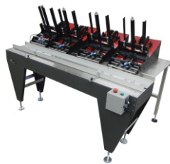
4-Station RX Collator